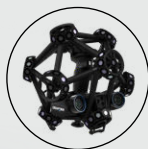
Also available for the MetraSCAN 3D