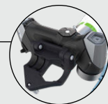
Quick release design: Switch from automated to handheld mode